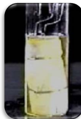
The first test-tube LIB cell (1983)

The LIB is widely used in the power supply of mobile phones, laptop computers, and various other portable electronic devices, and its use is now expanding into electric vehicles and stationary power storage applications. Many twists and turns occurred between 1981, when the development of the lithium-ion battery began, and the present day. The lecture describes the course of development, including several anecdotes about interesting incidents which occurred along the way. Based on this experience, Dr. Yoshino offers his perspective on the key to success in research and development, know-how in launching a new business, and how to forecast future market developments.